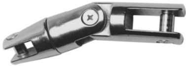
Double Anchor Swivel