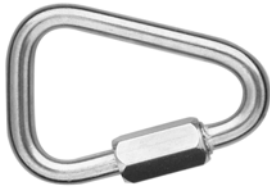
Delta Links Zinc Plated Steel