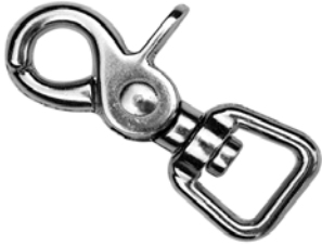
Trigger Snap With "D" Bail